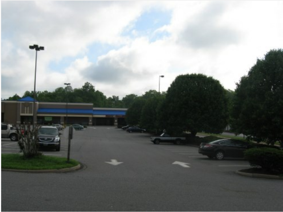
Spruce Street Station