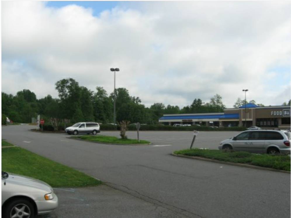
Spruce Street Station