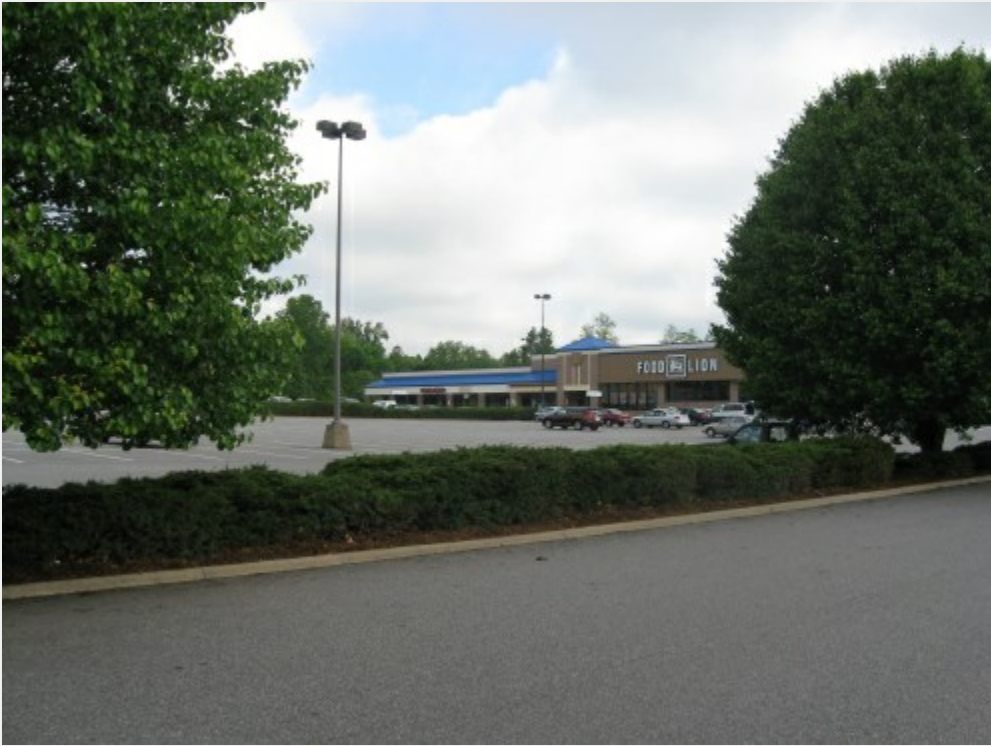
Spruce Street Station