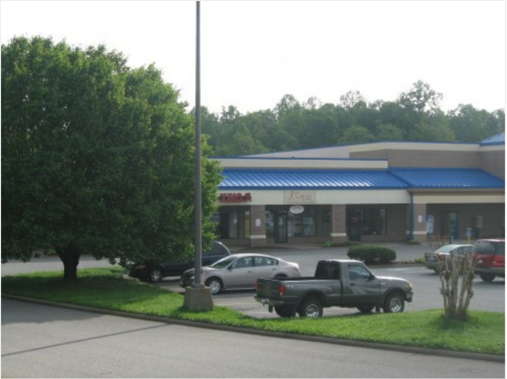
Spruce Street Station