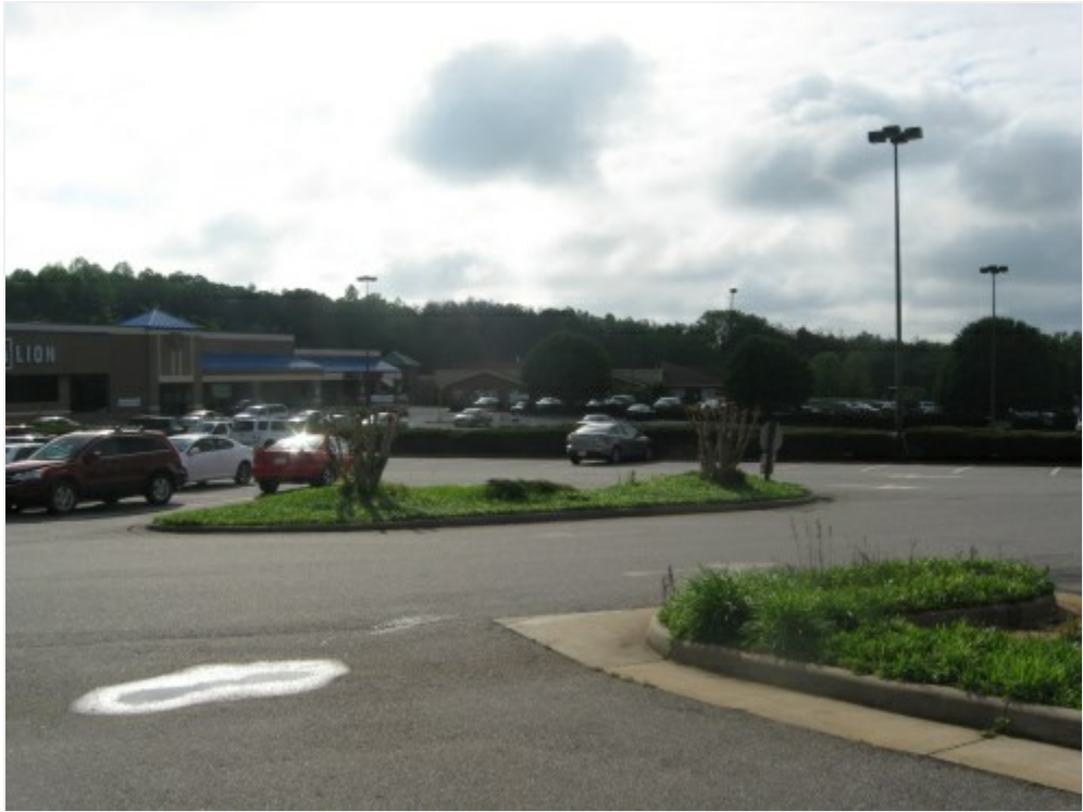
Spruce Street Station