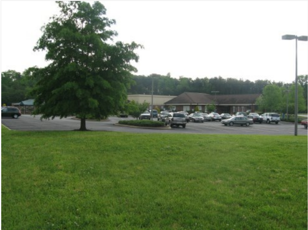
Adjacent to Carilion Medical Center