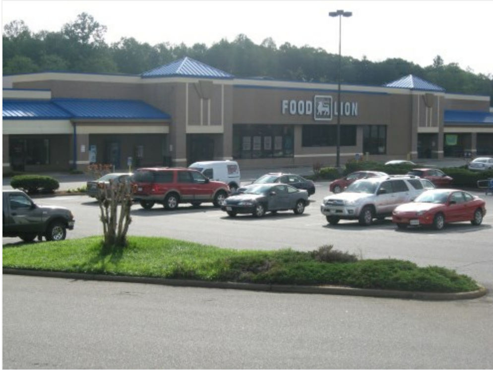
Spruce Street Station