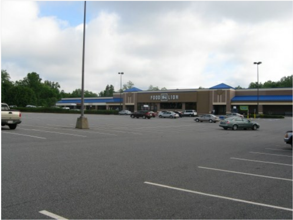
Spruce Street Station