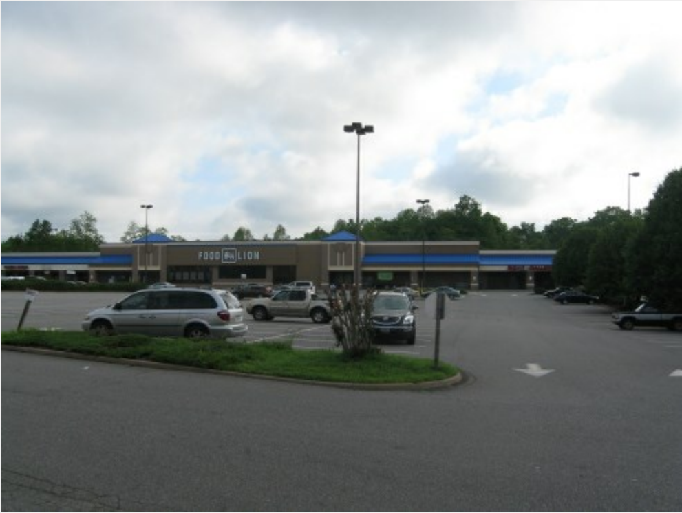
Spruce Street Station