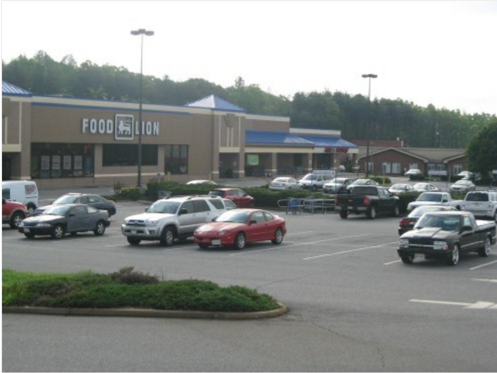
Spruce Street Station