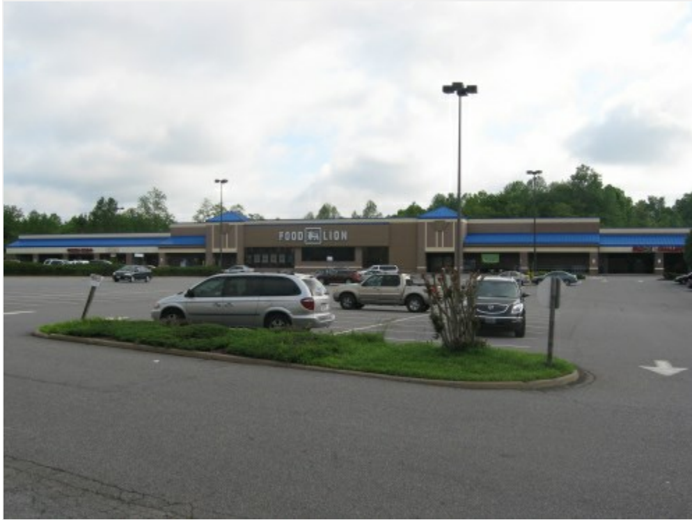
Spruce Street Station