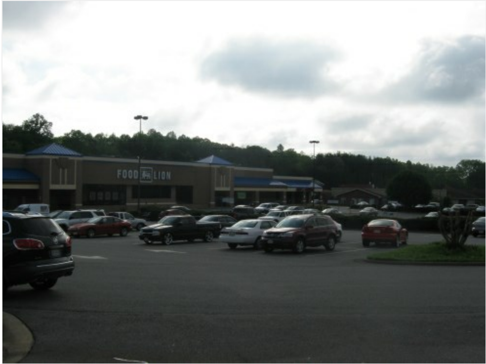
Spruce Street Station