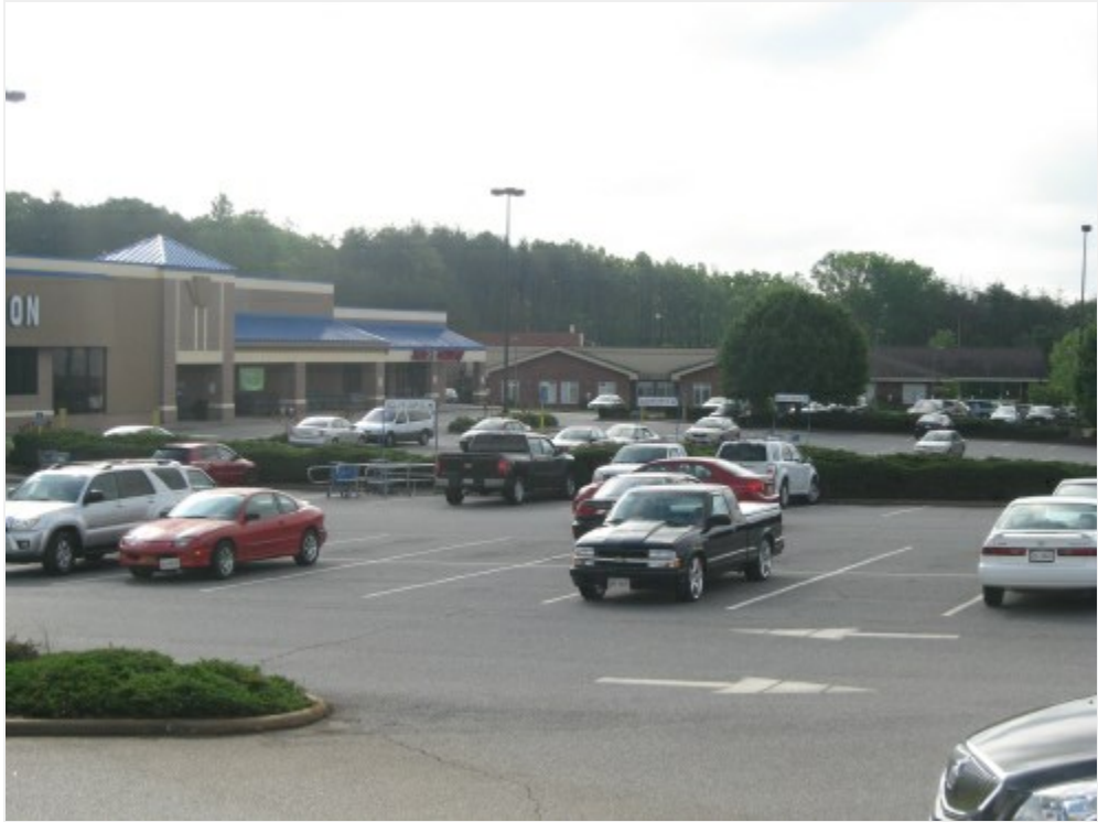
Spruce Street Station