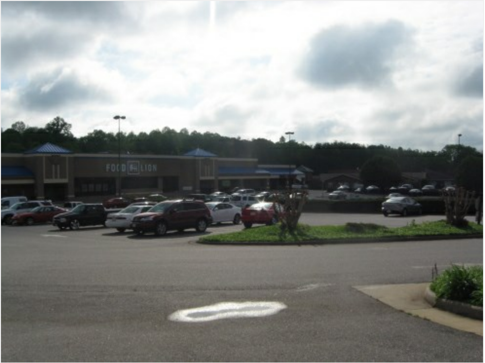
Spruce Street Station