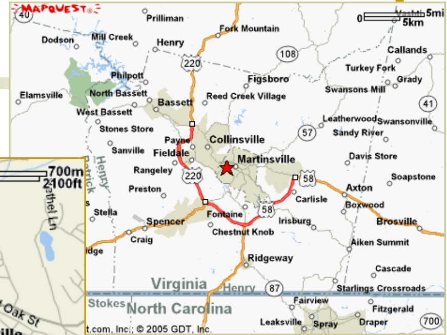
The Central Plaza - Martinsville, VA