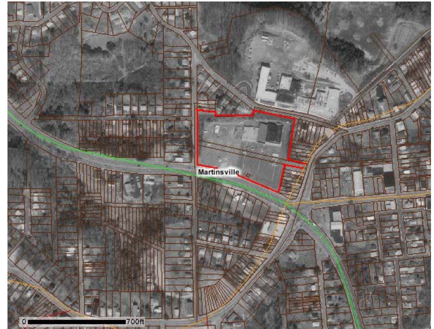
The Central Plaza - Martinsville, VA