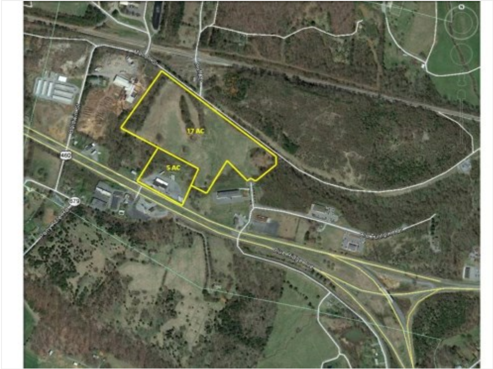
Additional 17 AC available