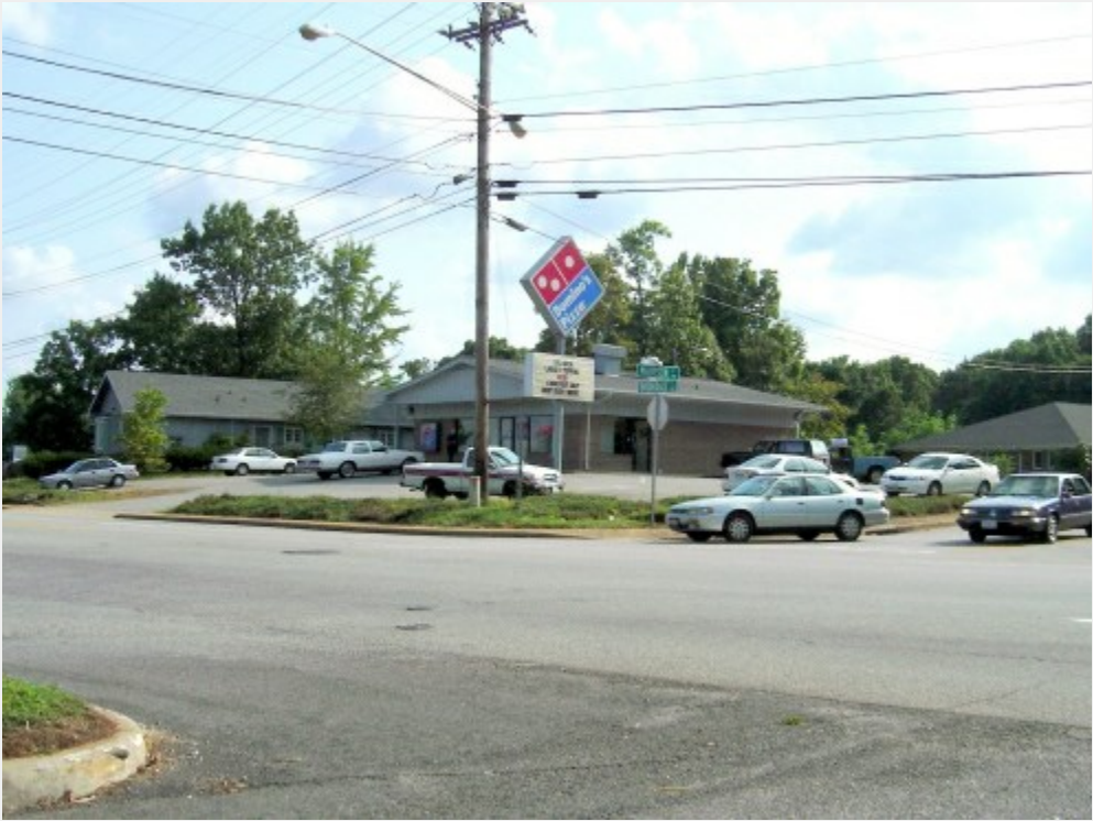
900 Brookdale Street