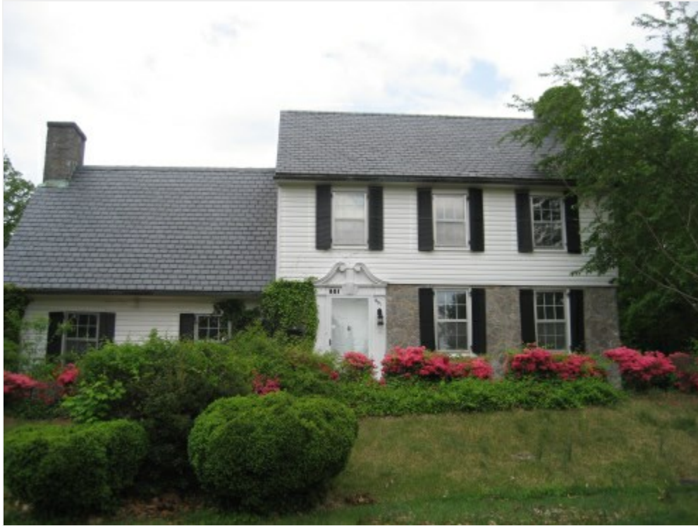
801 Starling Ave