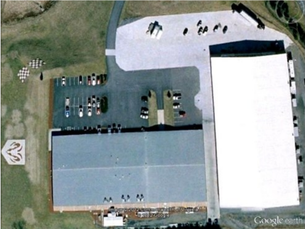
Aerial of Buldings