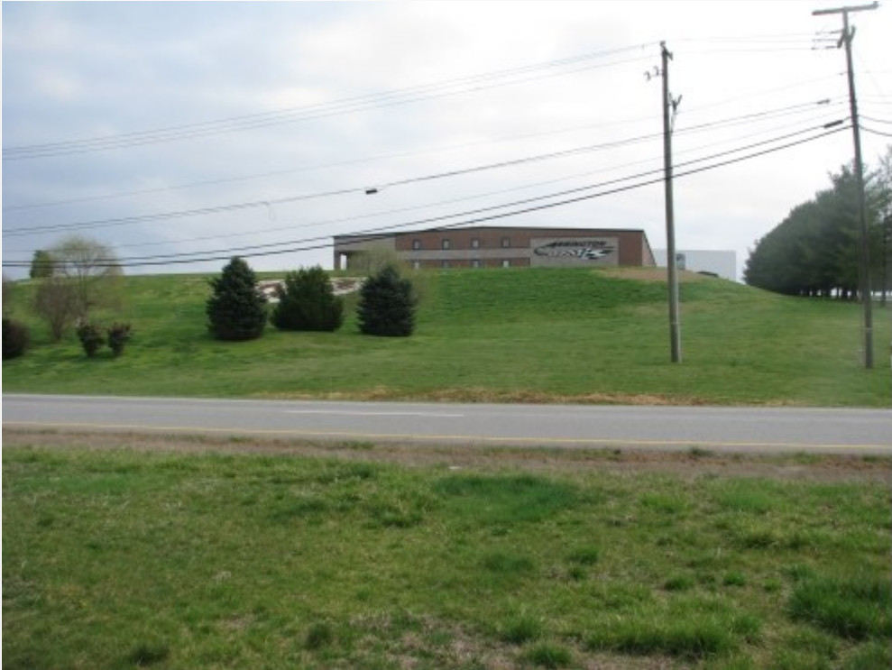
Front from highway