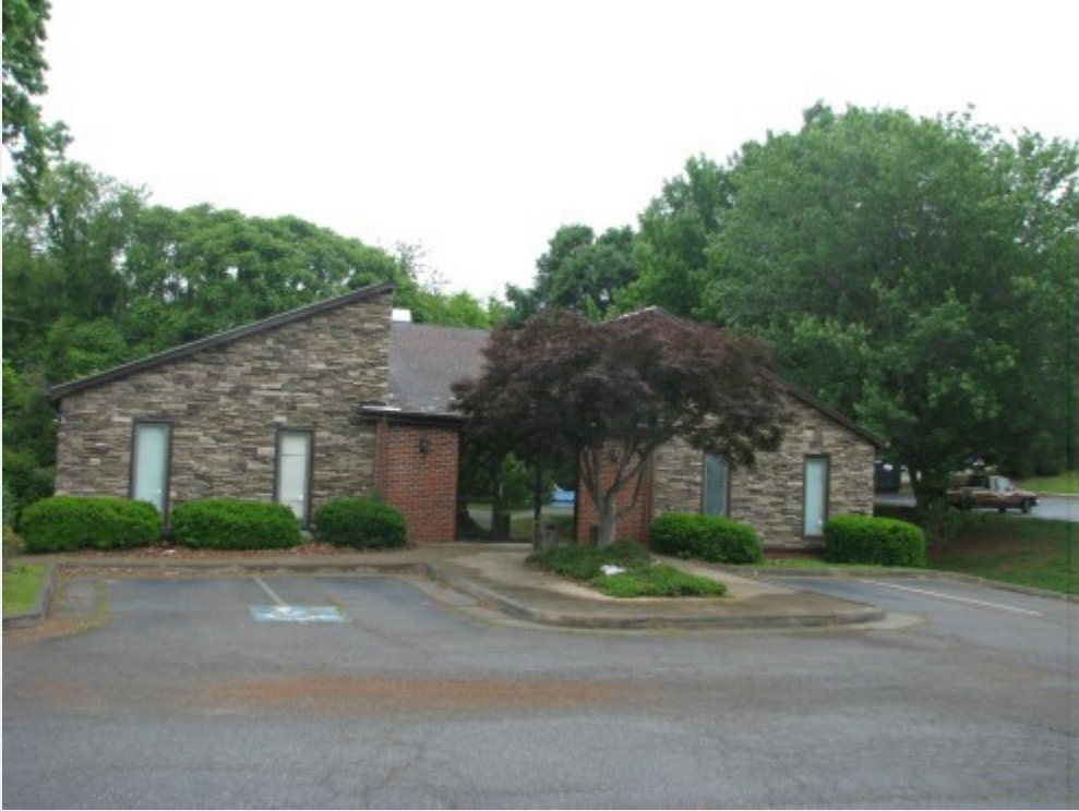
435 E Commonwealth Boulevard