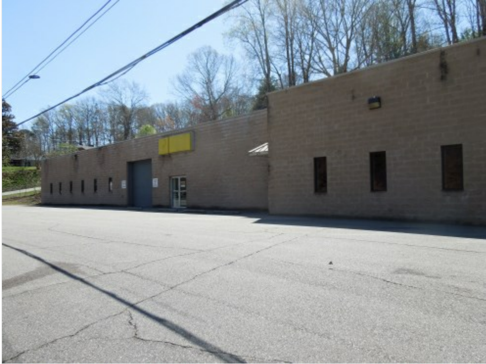
RoomBrick & Block Exterior with a total of 10,800 Sq.Ft.