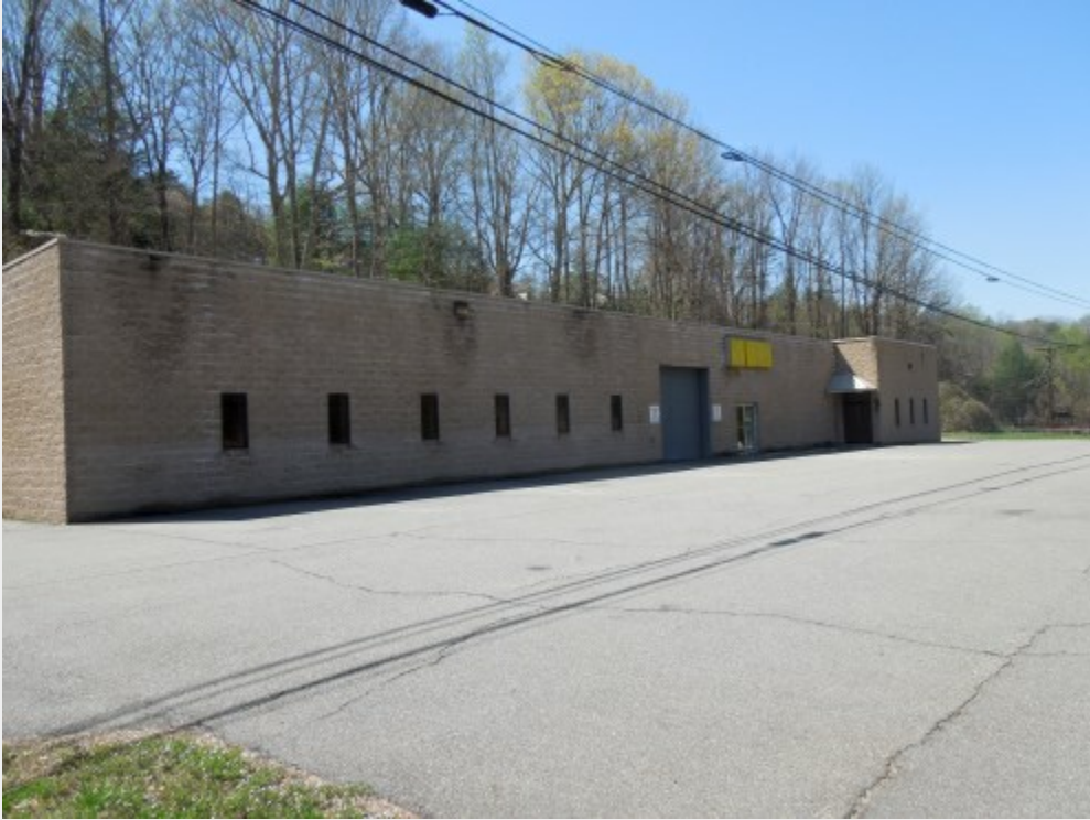
4173 Virginia Avenue