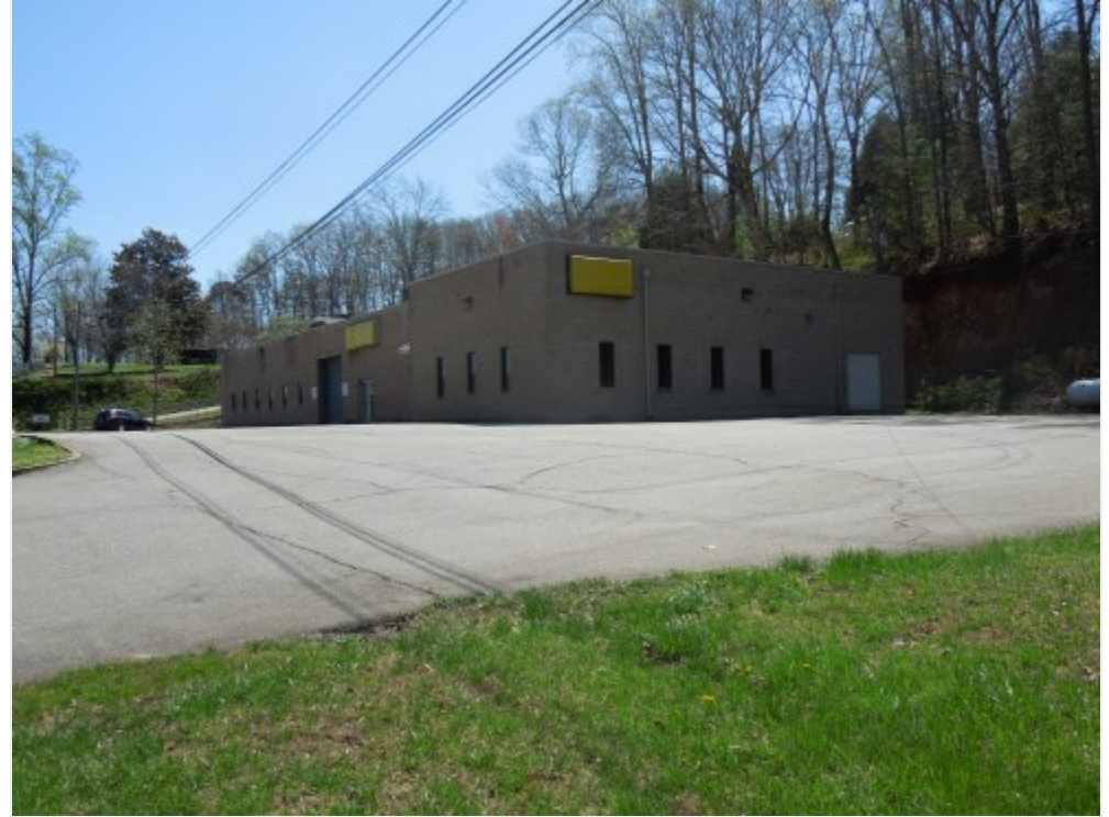
Warehouse: 8,600 Sq.Ft.