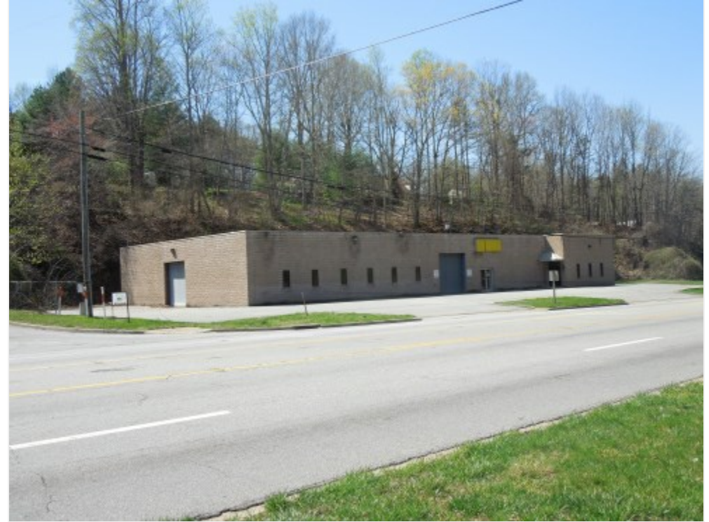
1.2 Acres with approximately 20 Parking Spaces