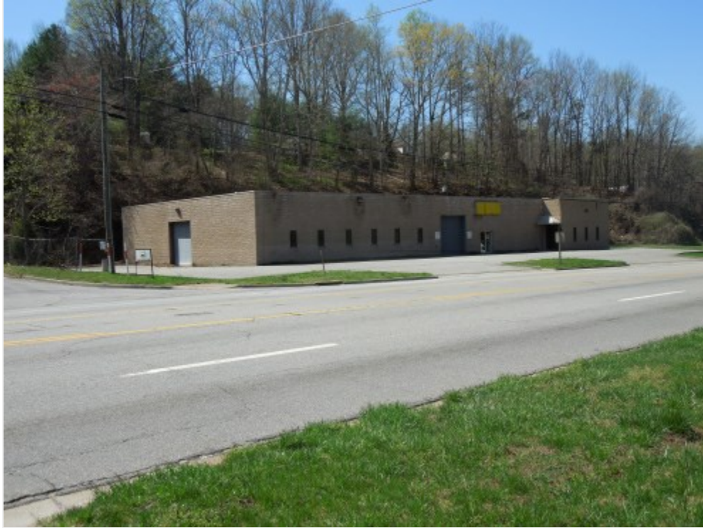
Good Highway Visibility on U.S. Business Rte. 220