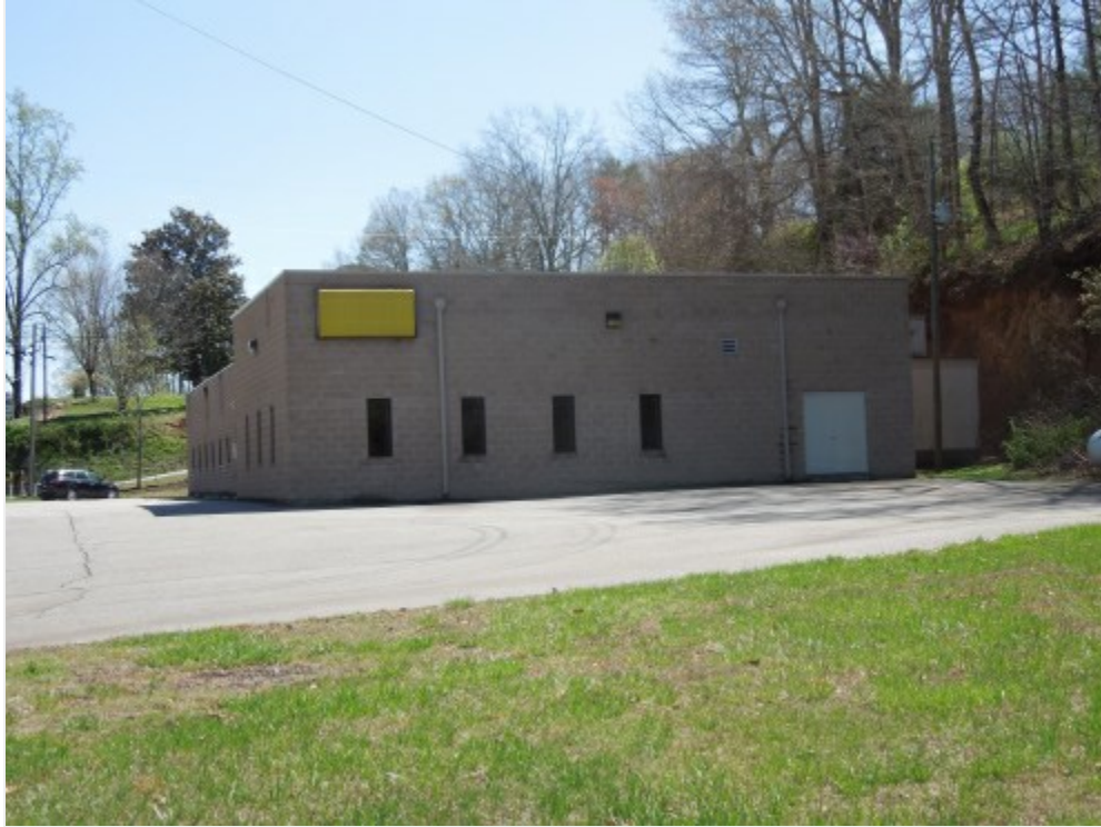
Large Showroom & Conference