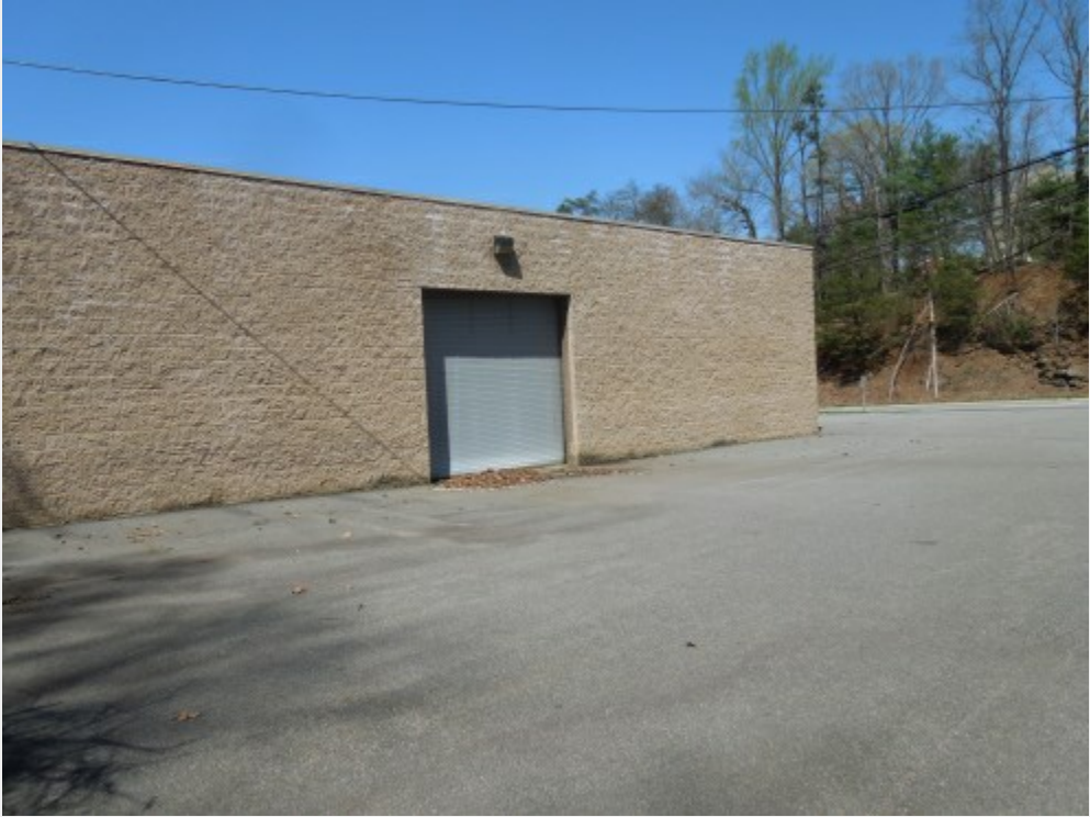
Two Drive-In Doors