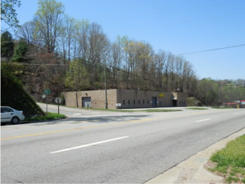
Good Highway Visibility on U.S. Business Rte. 220