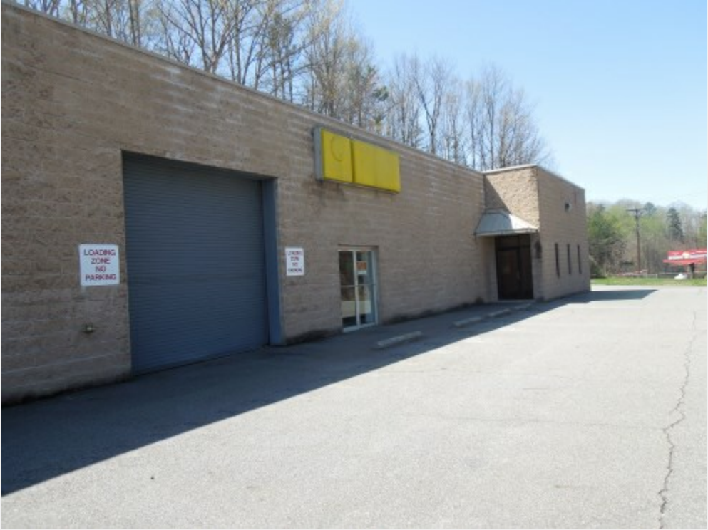
Two Drive-In Doors