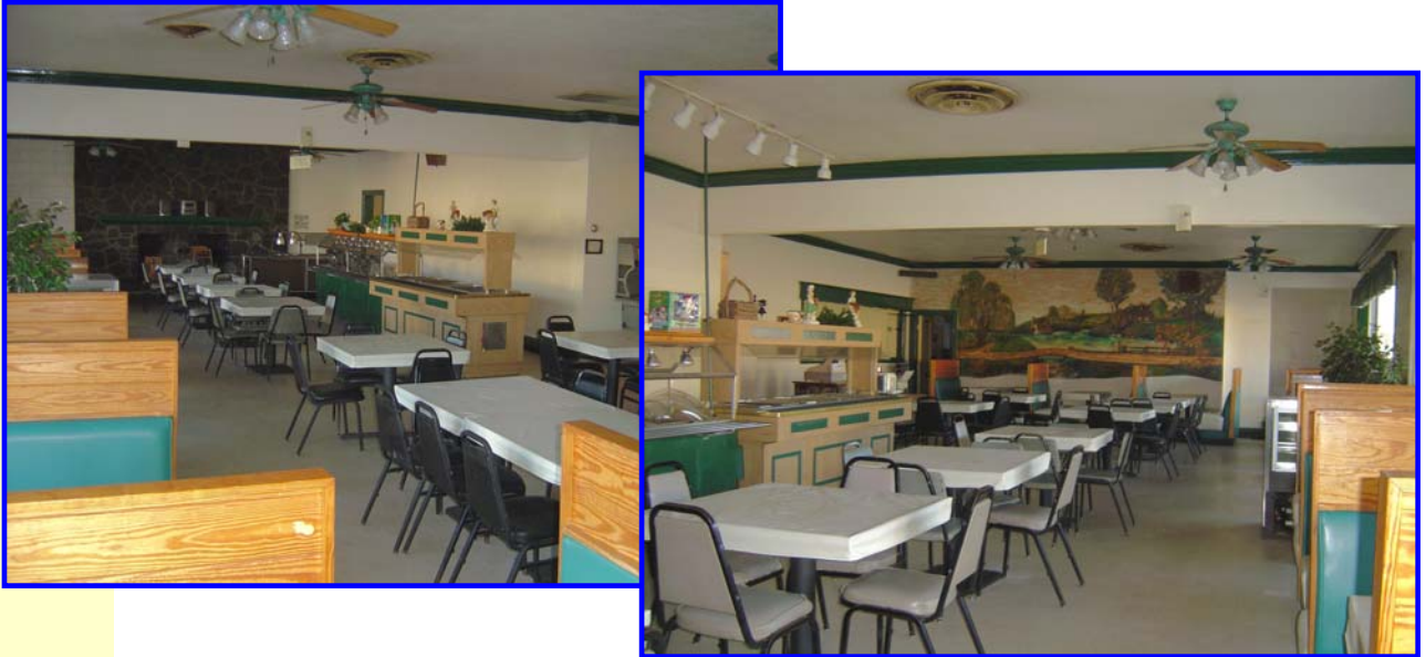
Front Dining Room Before

Front Entry is in middle of room and a hall extends back from the middle of the room that leads to another dining area, the serving area, kitchen and restrooms