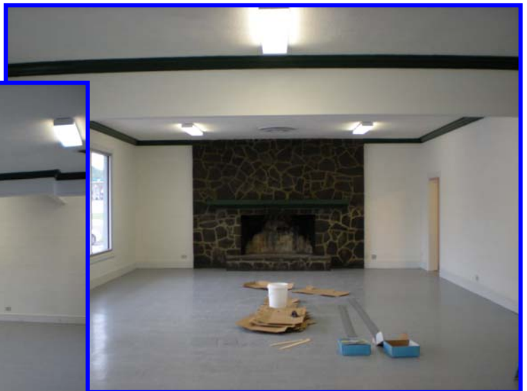
Front Dining Room Currently

Front Entry is in middle of room and a hall extends back from the middle of the room that leads to another dining area, the serving area, kitchen and restrooms