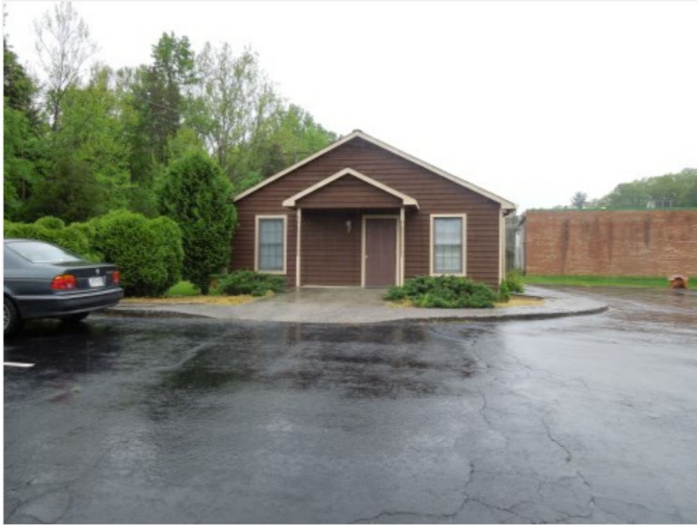
255 Riverside Drive