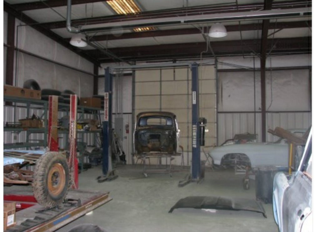
Automotive Restoration Shop