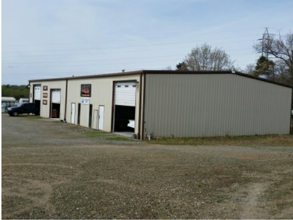
Automotive Restoration Shop