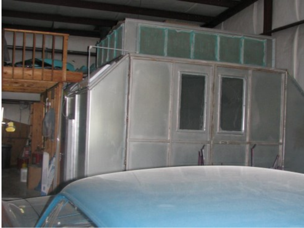
Automotive Restoration Shop