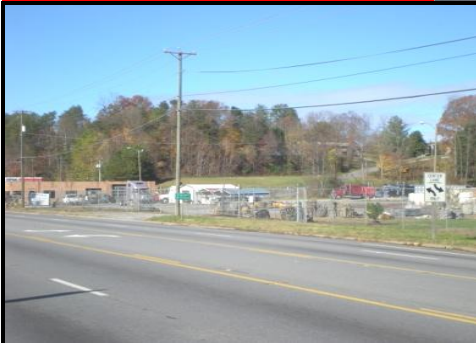
From Bus. U.S. 220 Facing North