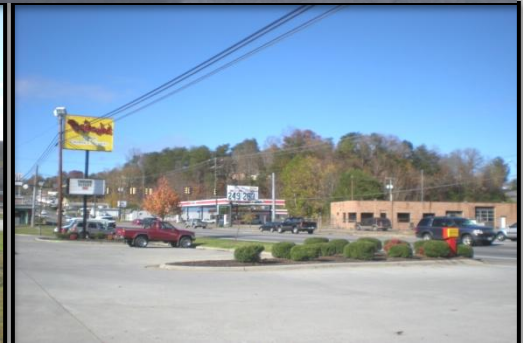
Intersection Includes Citgo/Kangaroo