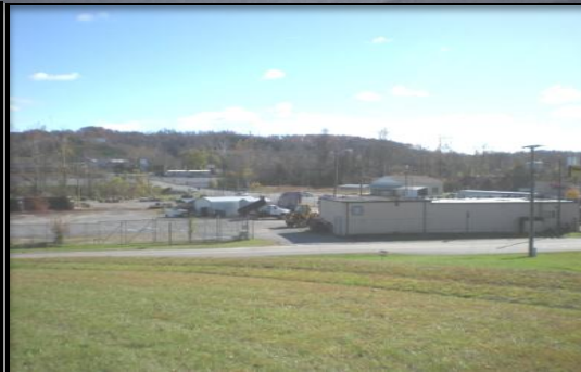
Smith Rucker Rd, Behind Site